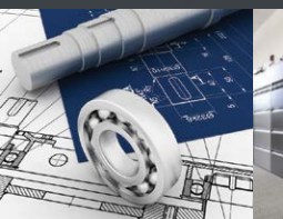
Engineering and Industrial services