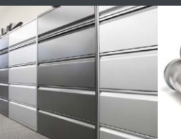
Sheet metal fabrication and assembly