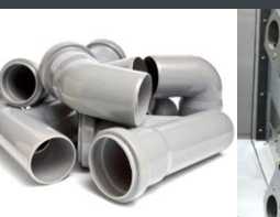
Plastics and Composites