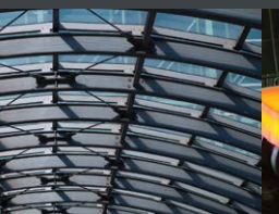
Structural steel and steel plate fabrication