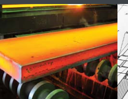
Heat and surface treatment